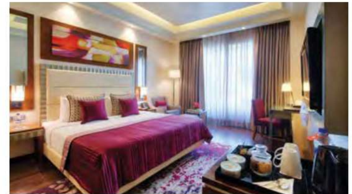
Aesthetically and Elegantly Decorated Luxury Rooms