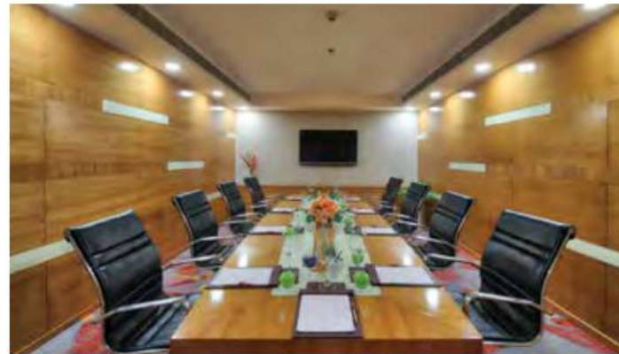
Well-Equipped with Business Facilities for Hosting Meetings