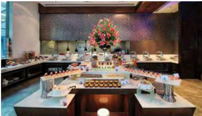
Multi Cuisine Restaurant and Bar Open Round the Clock