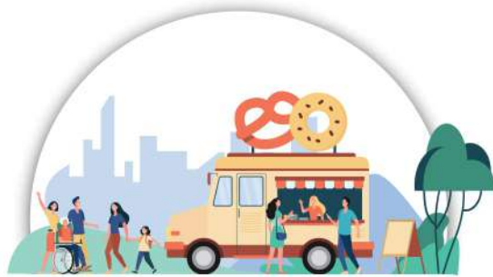
FOOD TRUCK ZONE